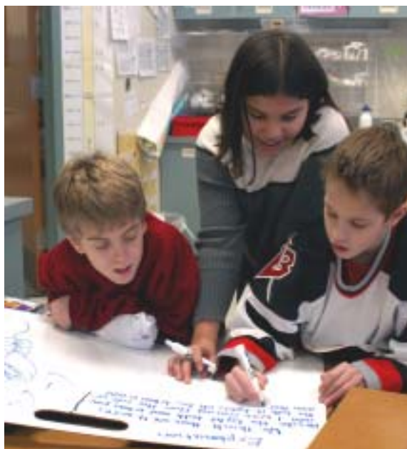
Ideas on Whiteboards are more open to discussion and modification.

groups are working on their whiteboards, the teacher’s role is that of facilitator. Ask clarifying questions, ask for more detail if it is needed, encourage creative, novel ideas, and be sure to not get stuck on helping one group. Students respond well to specific guiding questions. As you circulate and observe the students’ responses, feel free to stop the class and provide more guidance or structure as needed.