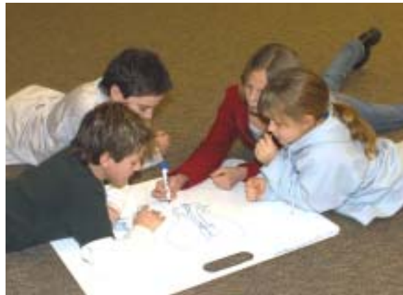
Give plenty of space for the students to work. A carpeted floor works great!

create an atmosphere in the classroom where ideas are student-generated, leading to students constructing their own evidenced-based knowledge.