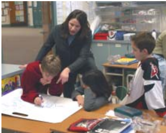
Circulating and asking guiding questions keeps the students on task.

bulb constructed?” They were instructed to draw a diagram of the inside of a three-way bulb and label the different parts. The students worked in groups of three or four and were given freedom to work at their desks or on the floor. They were given 20 minutes to complete their whiteboard. During this time the teacher circulated throughout the room giving encouragement, clarification, and guidance to the groups.