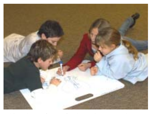
Give plenty of space for the students to work. A carpeted floor works great!

create an atmosphere in the classroom where ideas are student-generated, leading to students constructing their own evidenced-based knowledge.