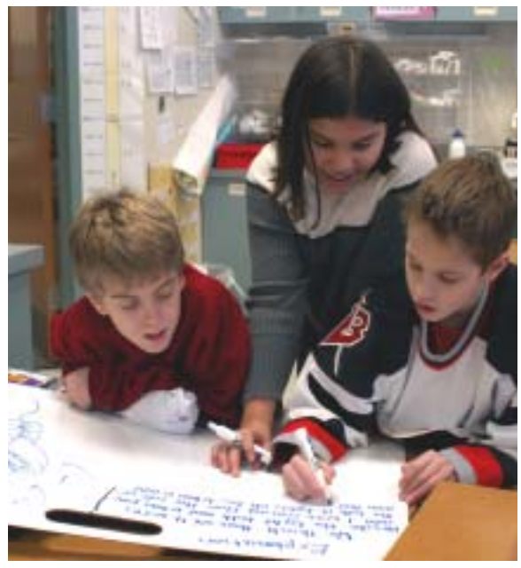
Ideas on Whiteboards are more open to discussion and modification.

groups are working on their whiteboards, the teacher's role is that of facilitator. Ask clarifying questions, ask for more detail if it is needed, encourage creative, novel ideas, and be sure to not get stuck on helping one group. Students respond well to specific guiding questions. As you circulate and observe the students' responses, feel free to stop the class and provide more guidance or structure as needed.