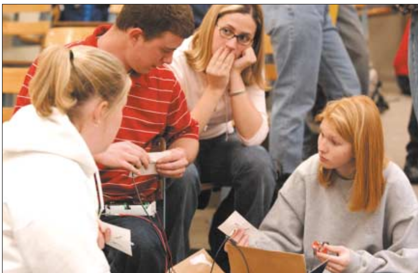
Student small group discourse in the lecture theater.

Teachers working with us have found that the RTOP is useful as a checklist for lesson planning purposes, in the mentoring and professional development of new or student teachers, and for their own personal pedagogical growth. Another commonly cited use is in defense of instructional change — for example, justifying the modeling method to administrators and parents who may be familiar with traditional instructional methods and require assistance in judging reformed teaching. Many aspects of inquiry teaching challenge traditional practice, and teachers tell us that RTOP helps validate and refocus their own journey into professional growth.